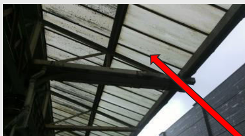
Asbestos Rope seals to sky lights/windows/glazing bars