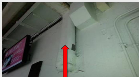
Asbestos thermal insulation